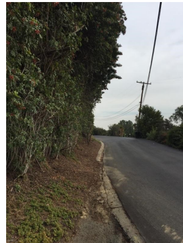
Compliant Emergency Vehicle Clearance