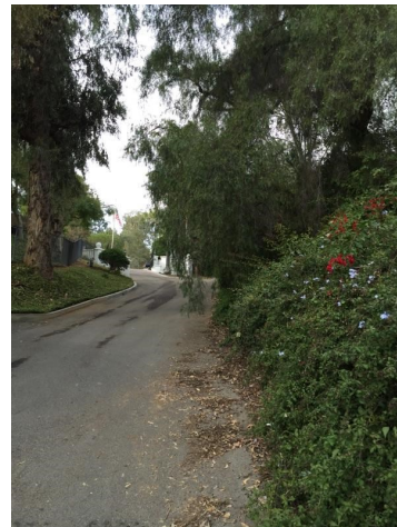
Non-Compliant Emergency Vehicle Clearance