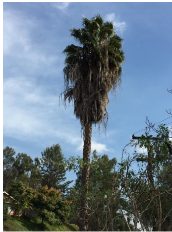
Non-Compliant Palm Tree

The ownership and address information shown are taken from the last equalized assessment roll. If either or both of these are incorrect, please notify the Los Angeles County Assessor.